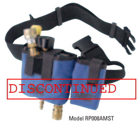
Model RP008AMST (Belt Mount)