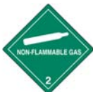
US DOT SYMBOLS